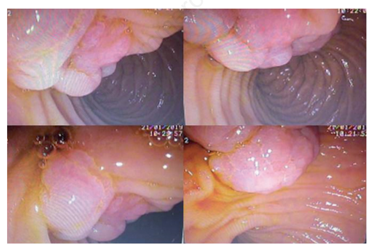
Figure 1. Upper digestive endoscopic images of the duodenal polyp with an irregular surface of a wine color, found in the bulbar flexure and extending to the second duodenal portion, approximately at 3.0 cm from the major duodenal papilla.

tumor markers carcinoembryonic antigen (CEA) and CA 19-9 were unremarkable. Computed tomography (CT) of the abdomen and pelvis showed a hypoattenuating image on the tail of the pancreas, measuring 0.5 cm, of probable cystic nature, and colonic diverticula. The aorta was atheromatous but of normal diameter. Chest CT showed the aorta and heart with regular dimensions. The UDE with duodenoscopy detected intense distal erosive esophagitis (Grade C of Los Angeles), a sliding hiatal hernia (type 1), and moderate erosive antrum gastritis. The duodenal papilla was normal, with intact mucosa and spontaneous bile drainage. Adjacent to the papilla, there was an extensive vegetating lesion, with a pinky irregular surface, and measuring approximately 30-40 mm. Biopsy samples revealed a tubulovillous adenoma with high-grade epithelial dysplasia. Besides colonic diverticula, the colonoscopy evaluated the distal ileum, where there were flat erosions with fibrin, and the histopathologic study showed hyperplasia of lymphoid follicles. Three months later, a UDE found a subpedunculated polyp measuring approximately 50 mm, with an irregular surface and a wine color, in the bulbar flexure and extending to the second duodenal portion 3.0 cm from the major duodenal papilla (Figure 1). After the mucosectomy, the established diagnosis was of intramucosal