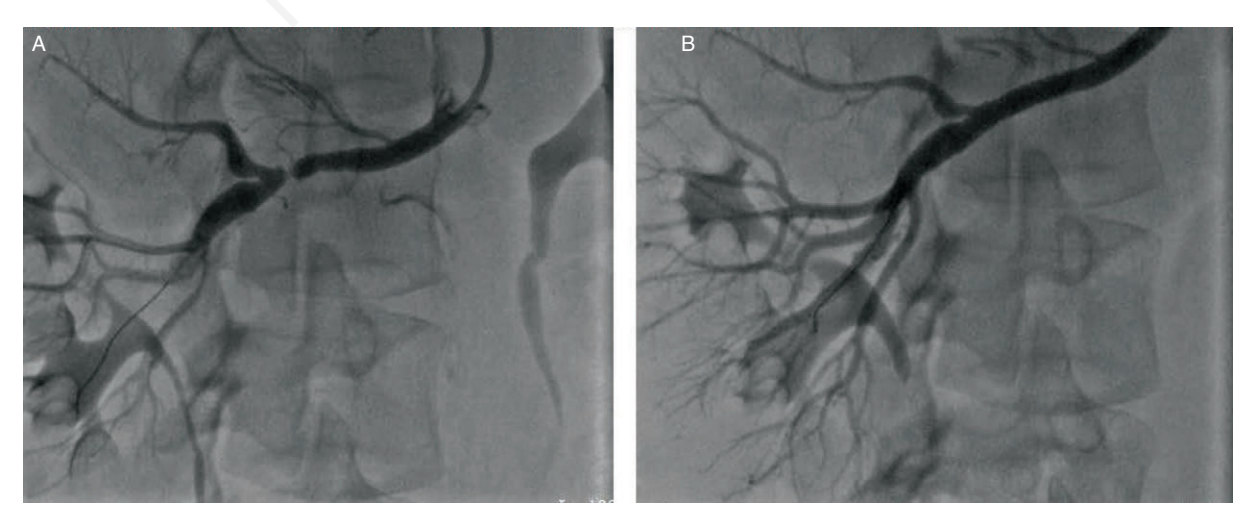
Figure 2. Renal arteriogram A) before and B) after stenting.