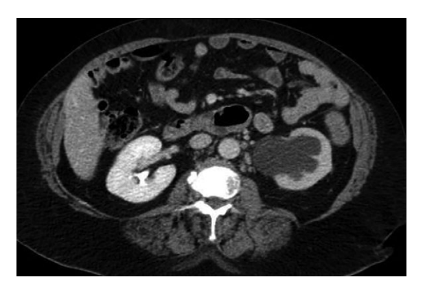
Figure 2. Abdomen computed tomographic scan showing hydroureteronephrosis.