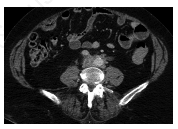
Figure 1. Abdomen computed tomographic scan showing retroperitoneal fibrosis.

IgG4 levels were within normal range. Urine cy-