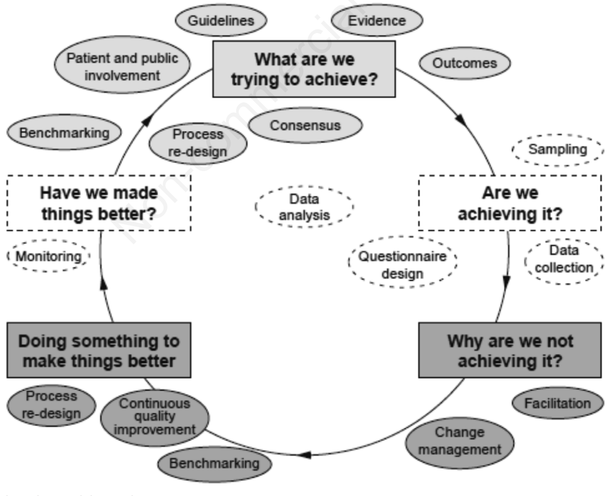
Figure 2. The clinical audit cycle.

The microbes are educated to resist penicillin and