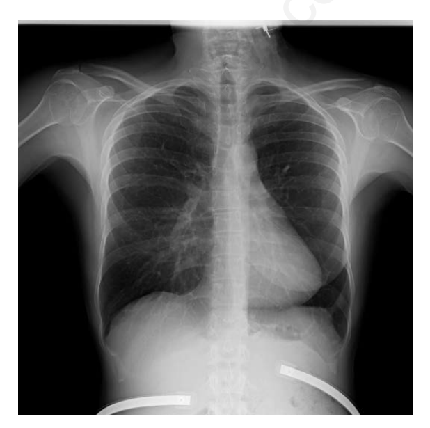
Figure 3. Case #2. Chest X-rays. Decreased volume of the right emithorax and unilateral hyperlucency of the left lung with reduced vascular pattern.

Clinically SJMS manifested itself with frequent episodes of bronchitis and/or bronchopneumonia associated with respiratory failure in childhood. Diagnosis can be made in this this age group with a simple