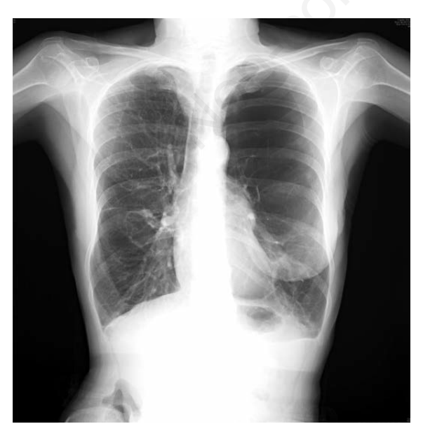
Figure 1. Case #1. Chest X-rays. Minimal hyperinsufflation of the left hemithorax, hyperlucency of the left lung and right middle lobe. Marked reduction of the vascular pattern. Limited areas of basal fibrosis.

The blood pressure was 130/80 mmHg; heart rate was 100/min and regular; respiratory rate was 20/min and morning oral temperature was 38.4^{\circ} C, O<sub>2</sub> saturation in room air was 93%. Cardiac auscultation was normal. Nothing else was relevant. Laboratory data revealed ESR=34, WBC=9100 (78% neutrophils),