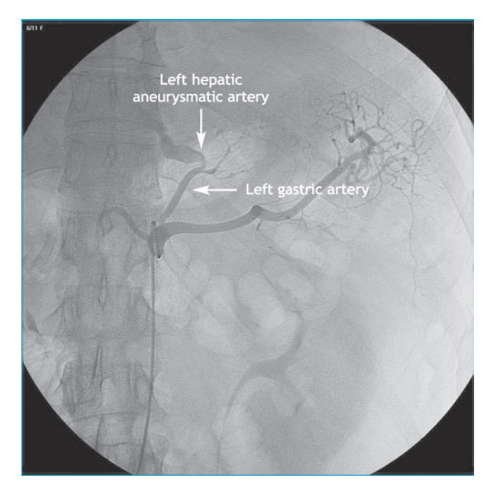
Figure 2 Selective hepatic arteriogram shows the presence of a left hepatic bleeding aneurysm. Left hepatic artery arises from left gastric artery.

a left hepatic bleeding aneurysm. As an associated finding, left hepatic artery arised from left gastric artery. A 4F Cobra glide catheter was advanced into the left gastric artery and the tip was placed in the hepatic artery aneurysm's neck. Fragments of absorbable gelatin sponge (Spongostan<sup>TM</sup>) were used to embolise the bleeding artery and the whole aneurysm. Haemorrhage immediately ceased, resulting in the resolution of patient's blood pressure instability. After haemostasis, late angiographic controls demonstrated no other bleeding sources. Further controls showed a good outcome. In order to obtain a permanent embolization with coils and/ or glues or with stent graft placement, angiography was repeated few days later, and no signs of bleeding were found. Moreover, it was impossible to enter into the aneurysm because of thrombosis. Our patient showed good recovery and up to-day he is still free from symptoms.