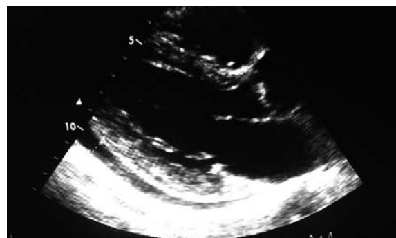
Figure 1. Parasternal long axis view with evidence of mild-moderate pericardial effusion.

HCT, hematocrit; MCV, mean corpuscular volume; MCHC, mean corpuscular hemoglobin concentration; PLT, platelets; ESR, erythrocyte sedimentation rate; CRP, C-reactive protein.