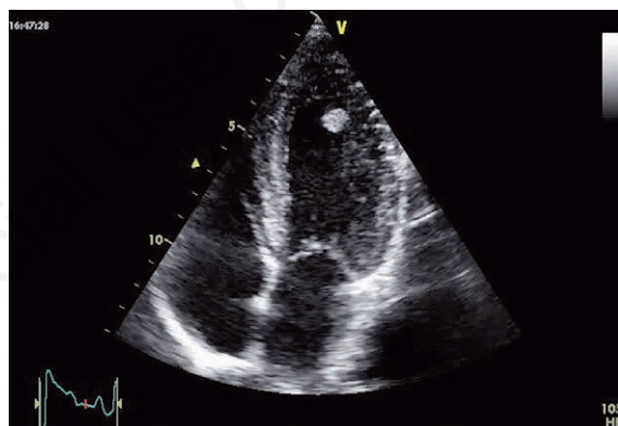
Figure 1. Transthoracic echocardiography revealed an echodense mass in the left ventricle (four chamber view) [see also online Video 1].

Malignant or highly vascular tumors demonstrate greater contrast enhancement than the adjacent myocardium. Stromal tumors display partial enhance-