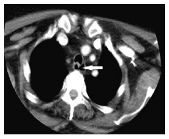
Figure 2. An air pocket seen arising from the esophagus consisting with esophageal diverticulum without clear signs of inflammation nor air-fluid level.